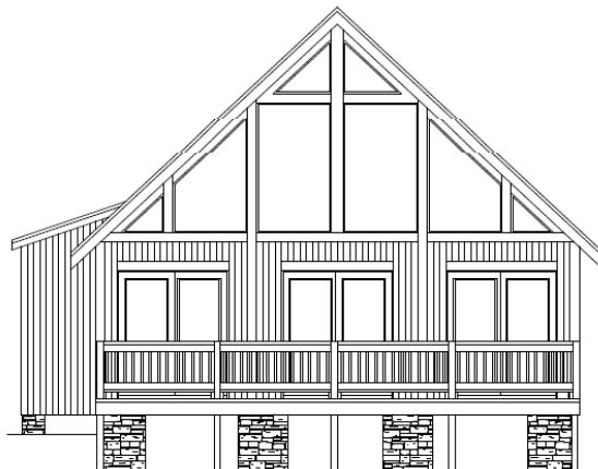
LAKE SIDE ELEVATION

ALL DECKS SUBJECT TO CHANGE AS PER GRADE AND SITE CONDITIONS.